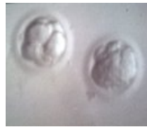
3 days after conception