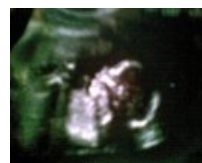
16 week scan 1