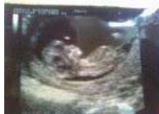
12 week scan