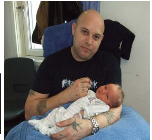
Me and my boy aged 4 days