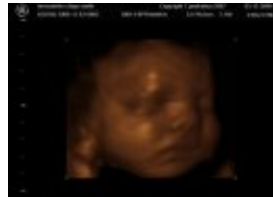
3D scan at 28 weeks

After trying for a baby for 5 years we decided to get some advice and found out that children were not possible in the normal way so in 2002 we made the decision to try IVF for the first time. Full of anticipation we embarked on a gruelling course of treatment in the knowledge that within six weeks we would be expecting our first baby. It never occurred to us that the treatment would not work. So when we found out that it had failed we were both devastated.