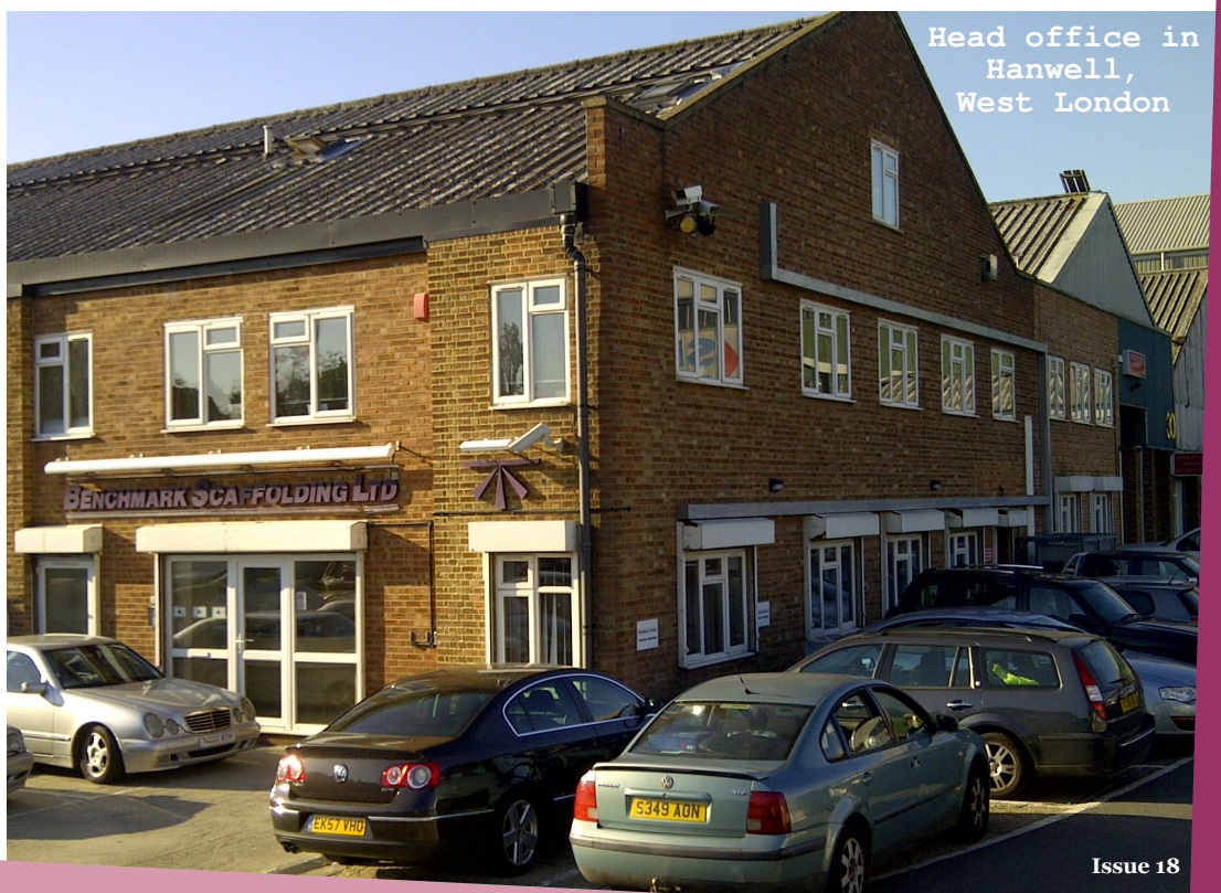
Head office in Hanwell, West London