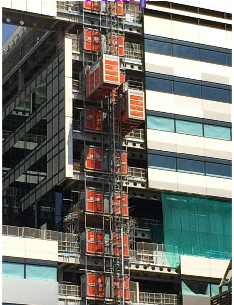
Alimak 650 5.0m x 2.0m PG Hoists with driverless control

The office buildings are set around four landscaped squares each providing an attractive working environment enhanced by restaurants, pubs, shops and health clubs close by.