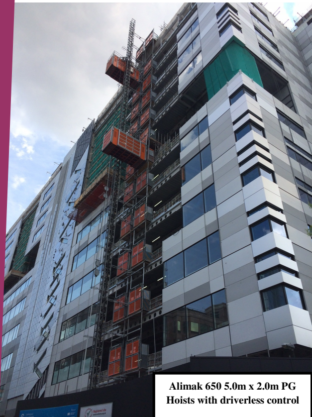
Alimak 650 5.0m x 2.0m PG Hoists with driverless control