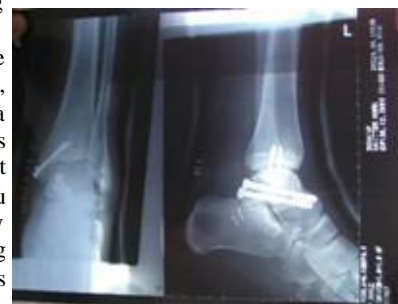
Left ankle with 4 huge screws