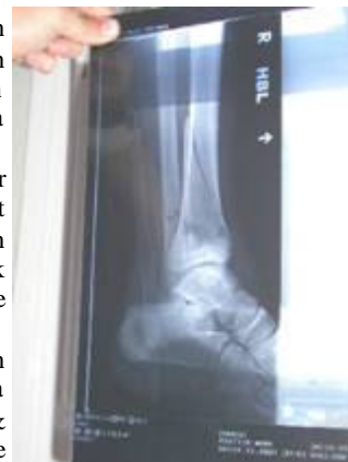
Right leg before

Our vision is to be the scaffolding contractor of choice to our customers and employer of choice to our people.