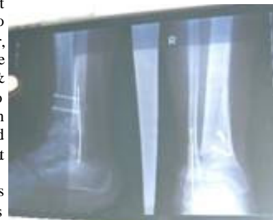
Right leg after fixator was removed